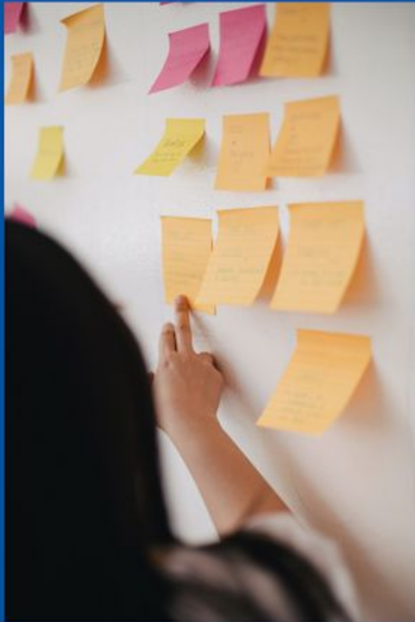
Simple - sticky notes