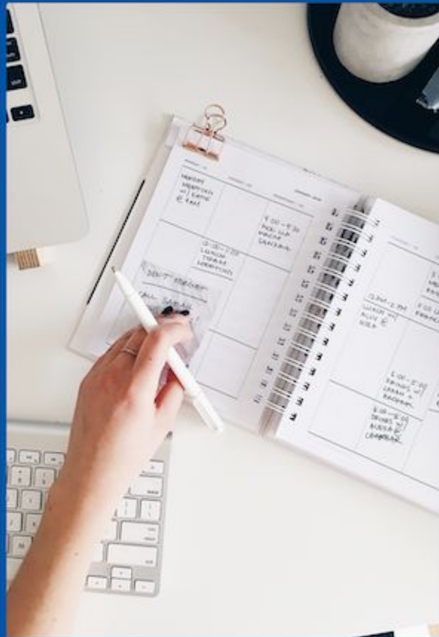
Intermediate - paper calendar