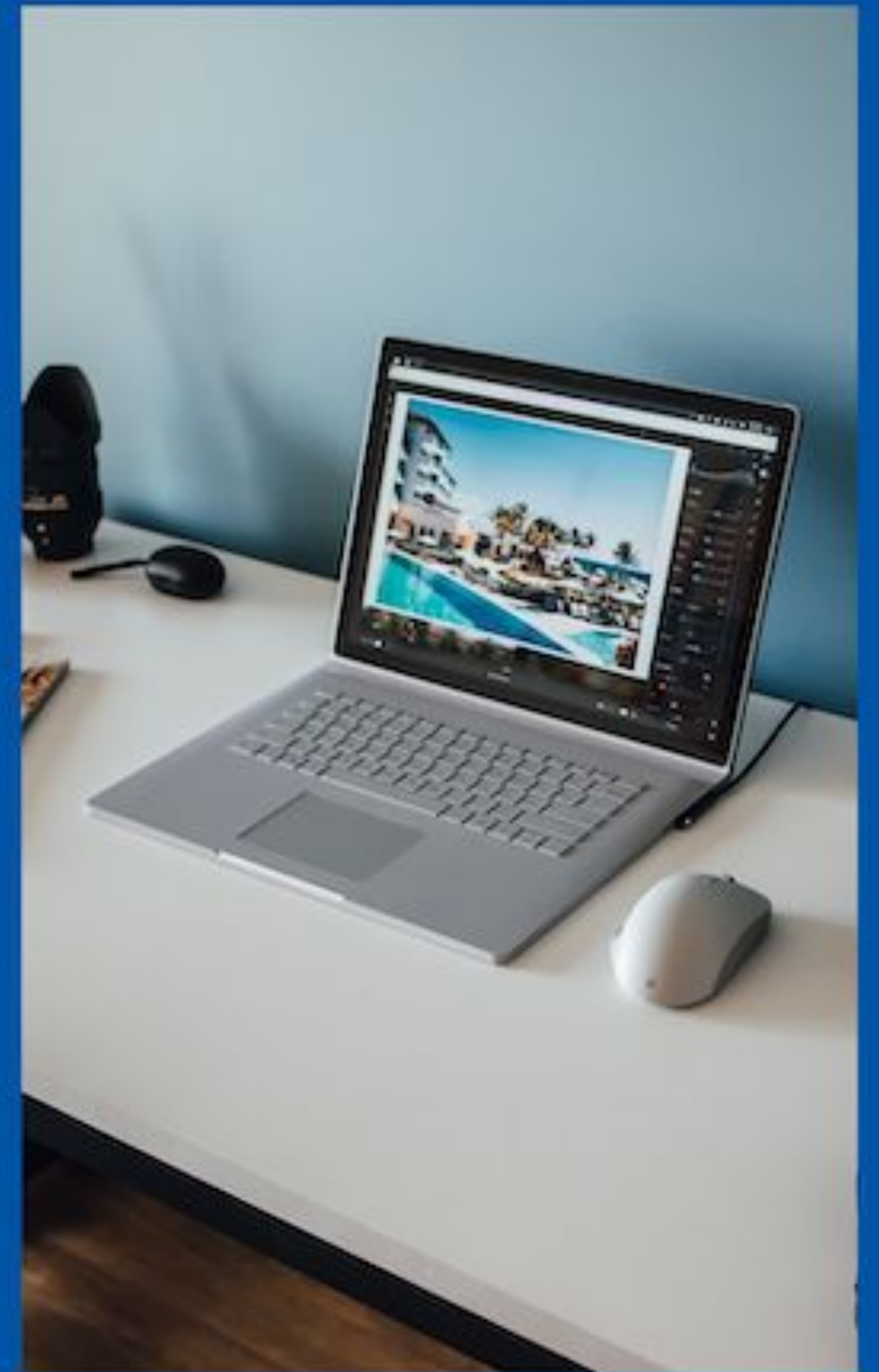
Adv. - Digital Management